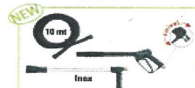
Dual Lance with professional gun, hose and swivel connector

The Sync is a professional grade, self contained, heavy duty hot water pressure washer. It offers a high quality 1750 RPM tri-plex pump with a brass head and long life ceramic plungers. The pump is coupled to a 4 pole continuous duty motor. The boiler is made with stainless steel and a treated double loop steel coil for efficiency. The machine is mounted on a steel frame with a tough rotomolded high density polyethylene body with resistance to rust and UV rays. There are 4 lift handles built in the frame and 4 large wheels for easy movement. The detergent and anti-scale tanks are built in. Anti-scale chemical is automatically metered with a level indicator. The control panel is 24V for safety. Total Timed Stop Control offers safety and efficiency, the machine shuts off with 30 seconds of inactivity, Total Stop after 20 minutes.