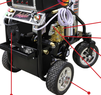
360° Front Swivel Wheels