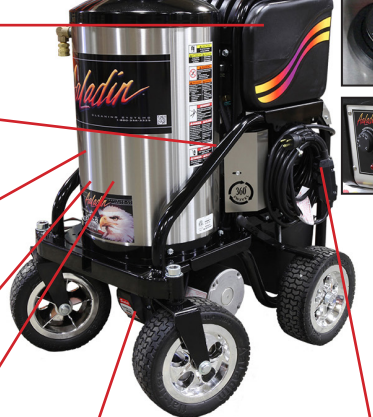
High Efficiency Burner Conserve fuel